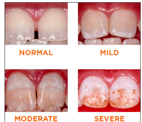
Fluorosis of the teeth

non-fluoridated areas in the 2009 “Our Oral Health Survey” conducted by the Ministry of Health.