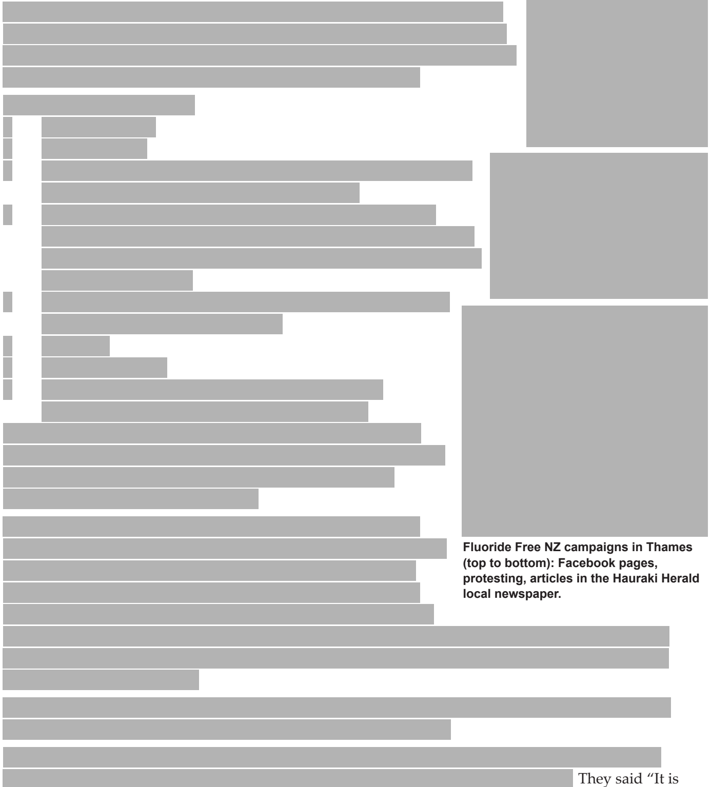
Fluoride Free NZ campaigns in Thames (top to bottom): Facebook pages, protesting, articles in the Hauraki Herald local newspaper.

Fluoride Free NZ has been involved in a number of campaigns to convince local councils and the public that fluoridation of water “doesn’t work, is not safe, and it robs people of choice.”